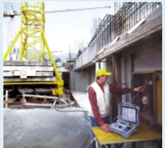
Testing of safety in a construction site on a switchgear