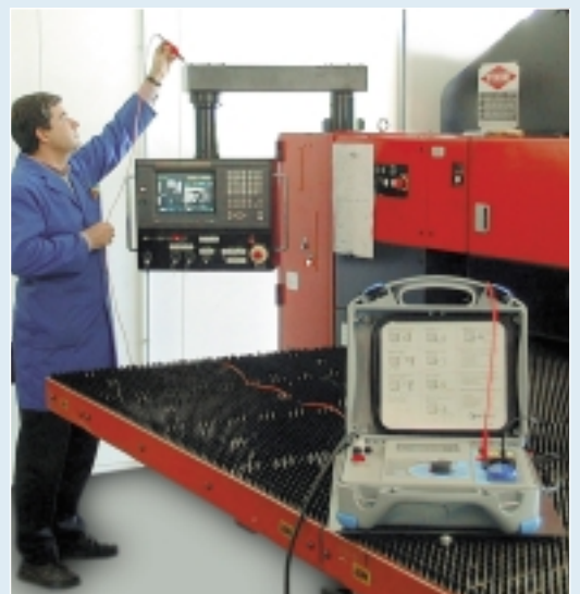
Complete testing of safety on machines (at initial installation or on periodic basis)

Automatic test: One-man operation by remote probe