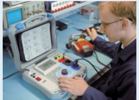
Final test on a portable appliance in a service workshop